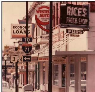
S. Court before, c.1965

https://www.nps.gov/subjects/historicpreservation/standards.htm