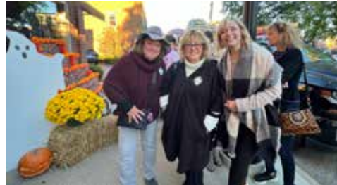
Ghost & Goblin' Walk