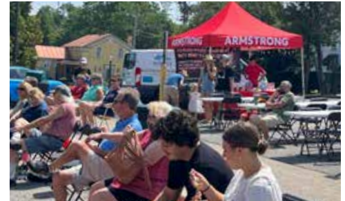
Medina Restaurant Week