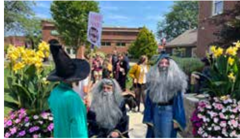
Wizarding Weekend & Gnomes on the Room