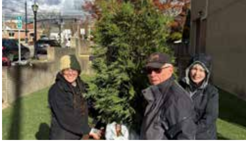
Medina Bee Park