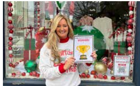
Storefront Decorating Contests