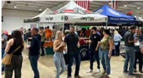
Medina Beer Fest