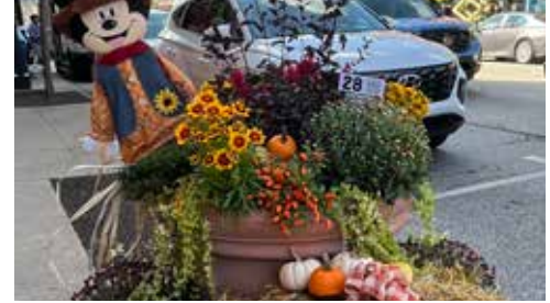
Fall Flowerpot Contest