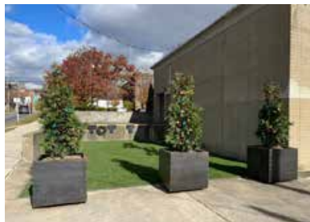
Completed Phase 1 of the Medina Bee Park to be unveiled in June 2026.