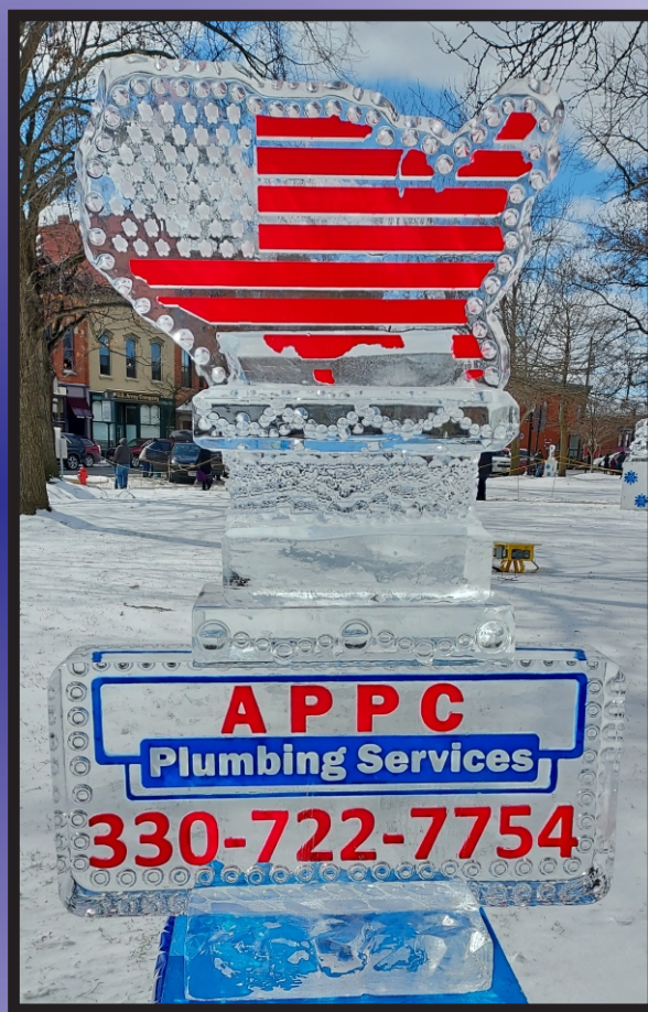
2.5 Block Design

Looking for something larger than life? Just ask! 10, 15 and 20+ Block Designs Available