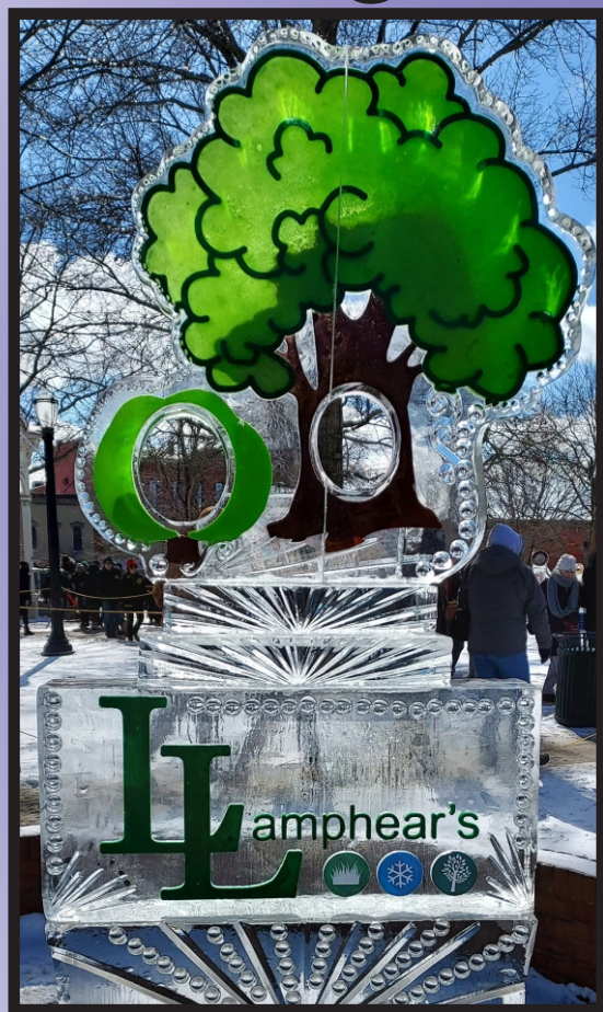
4 Block Photo Op